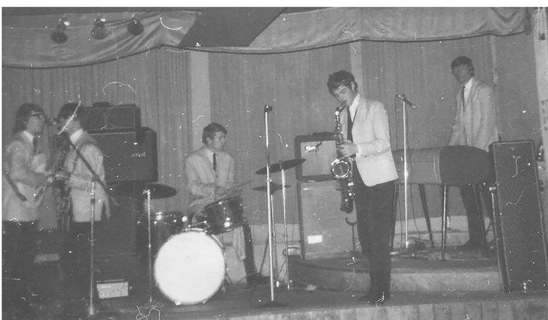
The Cheatin' Harts performing in Germany in 1966