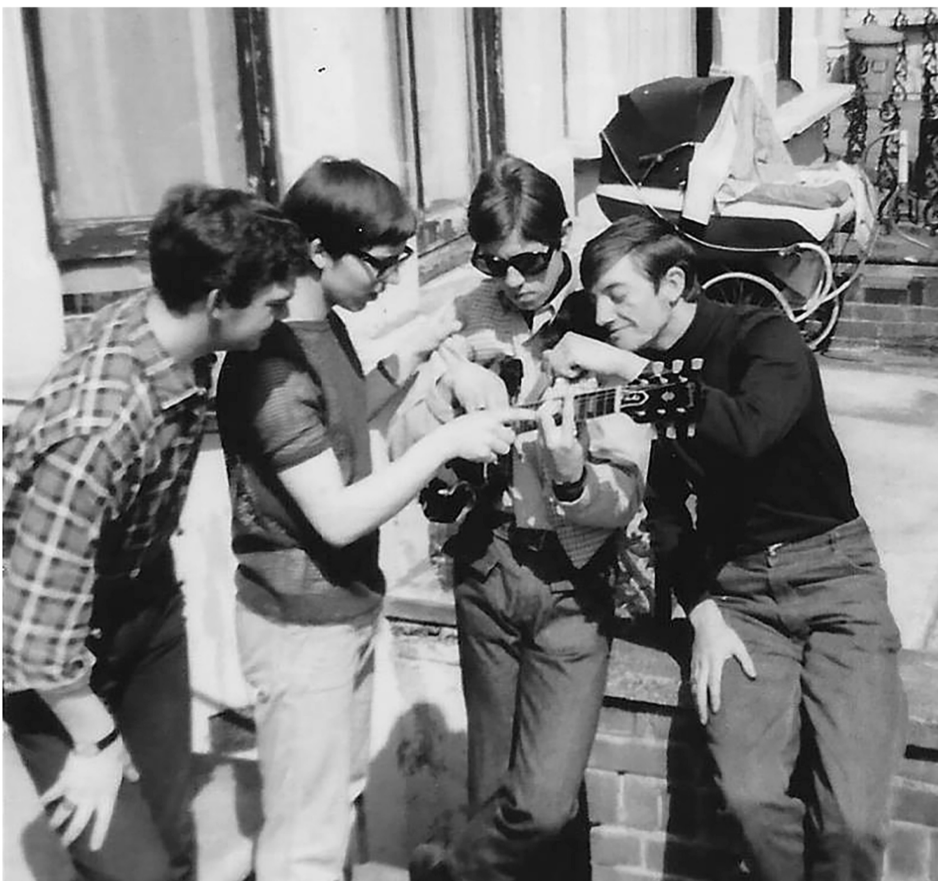
The Cheatin' Harts outside their flat in Hammersmith in 1966